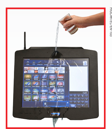
Water and Dust Proof Test IP66