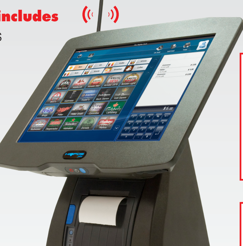
LCD Angle Adjust